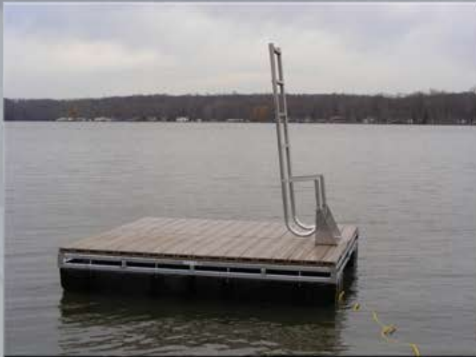
8'x 8' SWIM RAFT