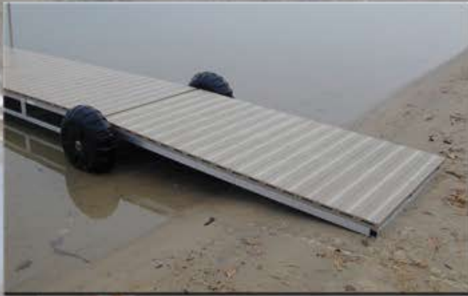
4' x 8' RAMP WITH LANDSIDE WHEEL KIT