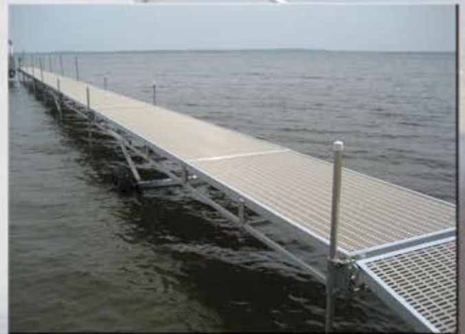
SHOWN WITH ELITE TRIM