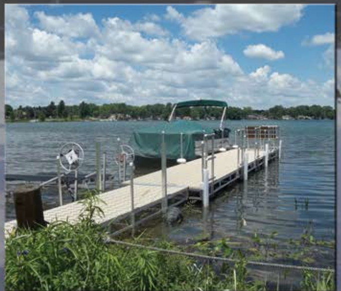
CUSTOM ROLLING/FLOATING DOCK