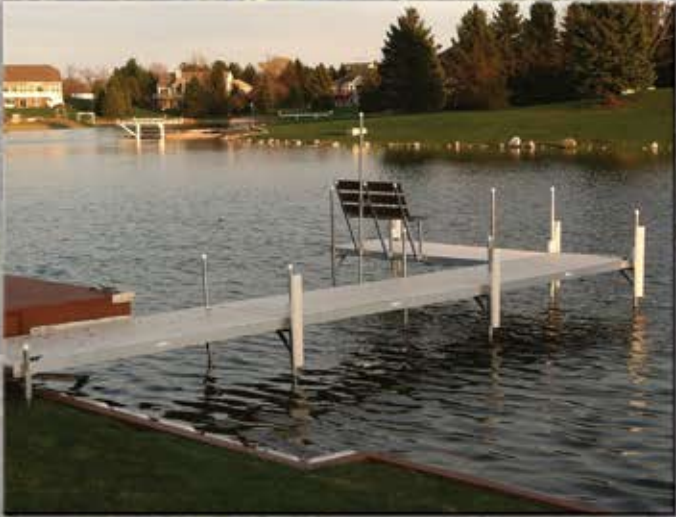
30' OF PREMIUM VINYL SECTIONAL DOCK WITH "L" SHAPE AND BENCH