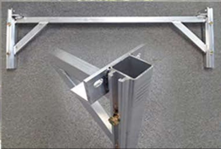
SUPERIOR FEIGHNER CROSS ARM WITH DIAGONAL BRACING FOR STRENGTH AND STABILITY