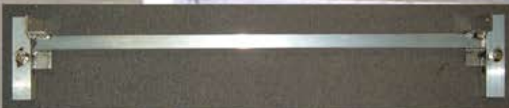
CLASSIC FEIGHNER CROSS ARM