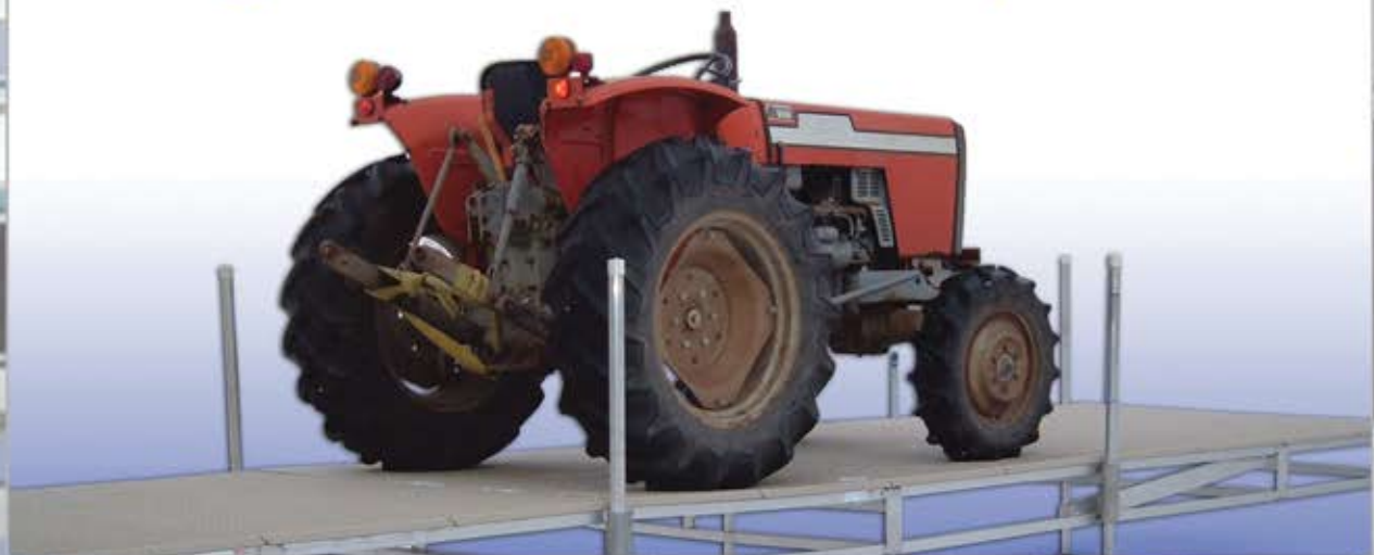
SPORT DOCK WITH AQUA DEK DECKING SUPPORTING A 4,500 LB. TRACTOR

If Aqua-Dek™ can withstand this, imagine what else it's capable of.