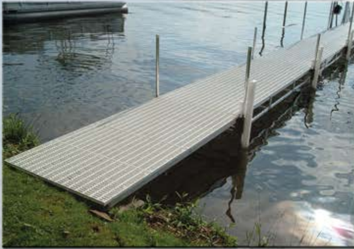
AQUA DEK ROLLING DOCK