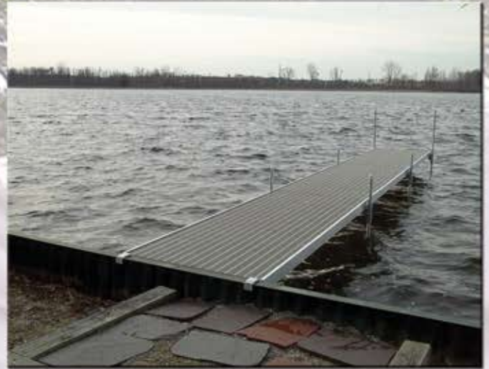
30' OF AQUA DEK SECTIONAL DOCK WITH CUSTOM SEAWALL BRACKETS