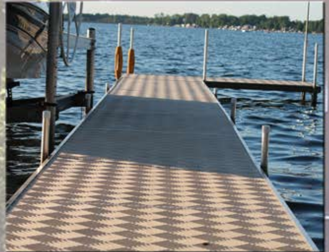
SUNWALK HD DECKING ON SECTIONAL DOCK