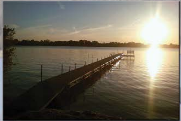
SPORT DOCK WITH OPTIONAL BENCH AND STEPS

If Aqua-Dek™ can withstand this, imagine what else it's capable of.