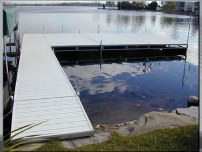
RESIDENTAL FLOATING DOCK