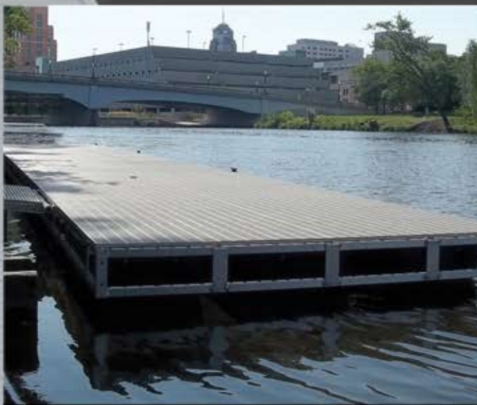
MUNICIPAL 8' x 32' FLOATING DOCK