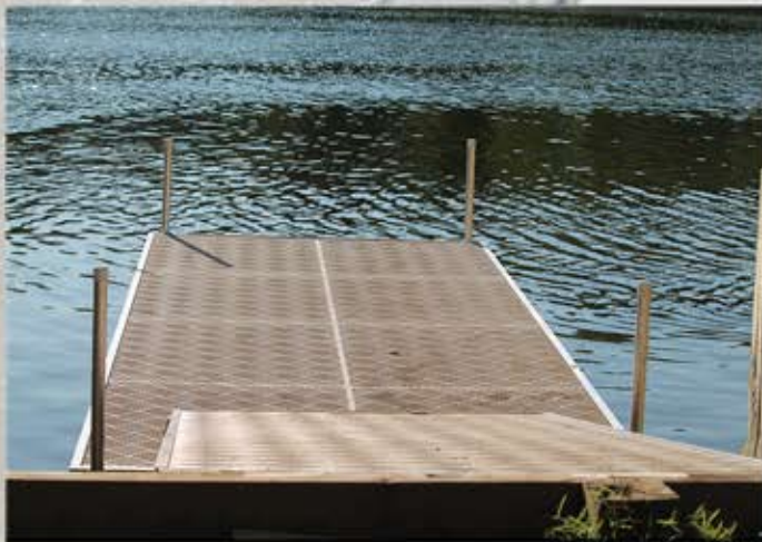
6' WIDE ROLLING DOCK