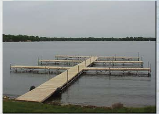
CEDAR ROLLING DOCK